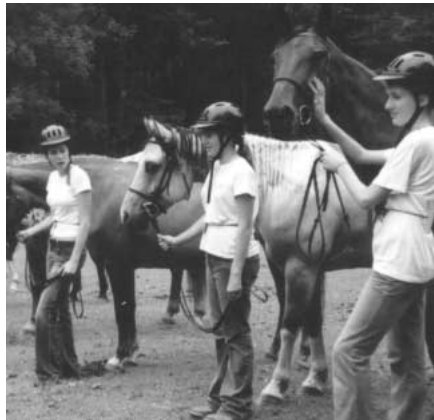
Each summer, more than 200 disadvantaged children receive scholarships to attend Camp Puh'tok residential camping session.