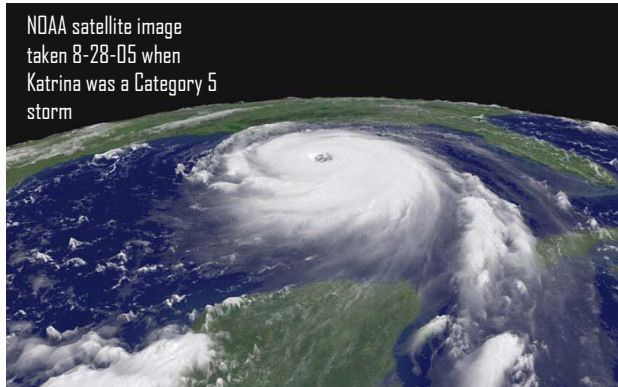
NOAA satellite image taken 8-28-05 when Katrina was a Category 5 storm

Hurricane Katrina hit the Gulf Coast August 29 as a Category 4 storm, destroying entire communities in Louisiana, Mississippi and Alabama. The scope of the devastation is unprecedented; hundreds of thousands lost their homes, their jobs and most of their possessions. As thousands fled east, some stopped in Beaumont. At The Salvation Army, more than 100 evacuees found shelter, food, medical care, and practical material help to start a new life.